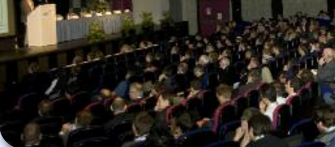
Opening Plenary, DATE 2011, Grenoble

DATE is sponsored by the European Design and Automation Association, the EDA Consortium, IEEE Council on EDA, ECSI, ACM-SIGDA & RAS. In cooperation with IEEE Computer Society (TTTC), IEEE Solid-State Circuits Society (SSCS), IFIP and IET