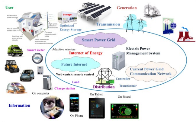
Fig. 4 Internet of Energy (IoE) concept The implementation of a smart grid is imperative to allow the

The connection of vehicles to the Internet gives rise to a wealth of new possibilities and applications which bring new functionalities to the individuals and/or the making of transport easier and safer. At the same time creating new mobile ecosystems based on trust, security and convenience to mobile/contactless services and transportation applications will ensure security, mobility and convenience to consumer-centric transactions and services. The Internet of Energy concept is illustrated in Fig. 4.