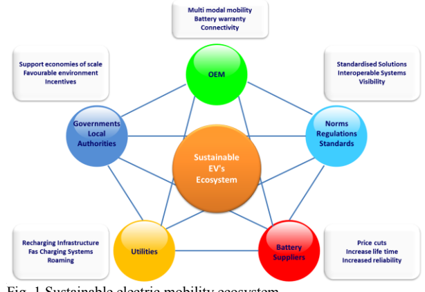
Fig. 1 Sustainable electric mobility ecosystem

The business models for the different charging options differ due to the different stakeholders involved in the process. The residential charging include the houses with parking and garages where the driver plugs in the vehicle every night/day, while for multi-unit housing the property manager provides charging in the shared vehicle park. An example of sustainable electric mobility ecosystem is illustrated in Fig. 1.