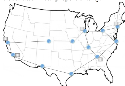
Figure 2: Network Topology; squares = data centers, circles = routers

In current routers, P_{idle} is high, thus the energy consumption is not at all proportional to network load limiting the potential savings. However, there have already been a number of proposals on how routers can be made more energy proportional [13,15], ranging from turning off line cards that are not being used, to more complex circuits and system solutions. Figure 1 shows the power models of routers we use in our simulations. The non-proportional model represents measurements of an actual state-of-the-art router [14] that is capable of supporting four 100Gbps links concurrently. Its peak and idle power value are listed in Table II. The step function proportional is the power curve we measured by removing line cards from the same router - similar to on/off approach presented in [11]. Smooth proportionality model assumes techniques have been developed to "smooth out" the step proportional curve, while the ideal proportionality represents the best case linear proportionality.