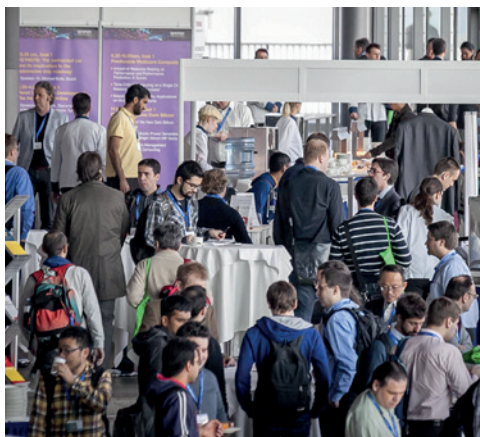
The vibrant exhibition at DATE 2016, Dresden

* Exhibition Reception from 18h30 – 19h30